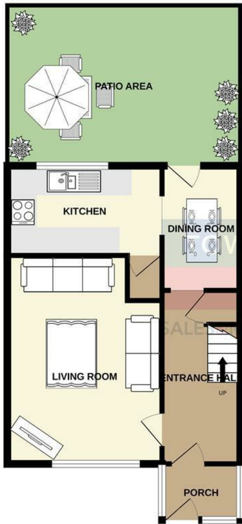
GROUND FLOOR 435 sq.ft. (40.4 sq.m.) approx.