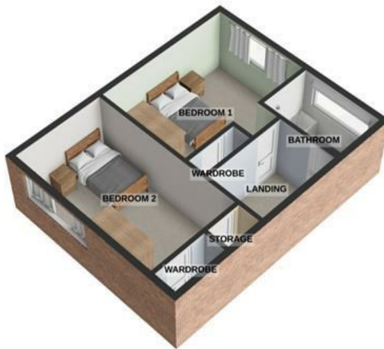
TOTAL FLOOR AREA : 844 sq.ft. (78.4 sq.m.) approx.

For illustrative purposes only. Decorative finishes, fixtures, fittings and furnishings do not represent the current state of the property. Measurements are approximate. Not to scale. Made with Metropix © 2024